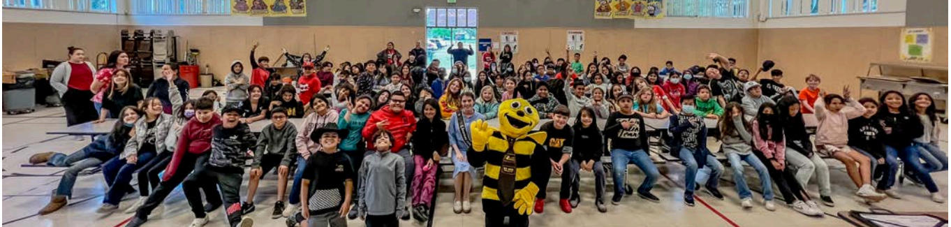
Photo taken at Dingle Elementary School

The American Beekeeping Federation's, American Honey Queen Program promotes the importance of beekeeping and honey bees to Americans. It focuses on educating consumers about U.S. honey through school visits, fairs, and media outreach. The Honey Queen and Honey Princess engage audiences with presentations on pollination, honey properties, and hive components, aiming to boost honey consumption nationwide.